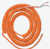
Coiled grounding cable up to 15 m