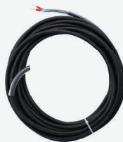
Straight grounding cable up to 30 m