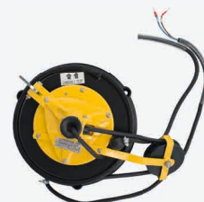
Cable reel up to 10 m