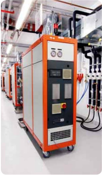
The temperature controllers of the tecco-tt and th-series meet the special requirements for operating temperatures up to 300 °C respectively 350 °C.