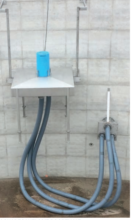
AQUADECANT* 2017 BOORTMALT