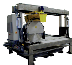
STS/N-SK bridge saw with adjustable cutting device for rip and angle cutting