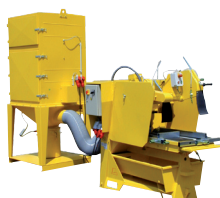
STS/N+T 55 Combination saw for dry and wet cutting only in connection with dust collection unit CF 30 G