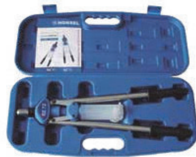
All HONSEL lever riveting tools are supplied in an impact-resistant plastic case.