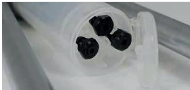
Replacement nose pieces in closed compartment on the mandrel collector.