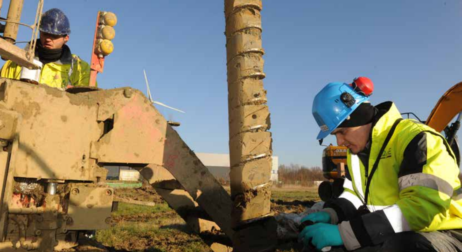
The soil investigation manager follows the dossier all the way through the soil investigations and the feasibility study