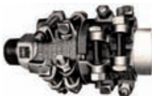
Rotary Hose Coupling