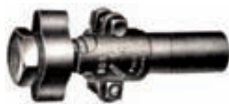
Original "Boss" Coupling, patented 1917