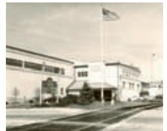
Chestertown, Maryland manufacturing facility

In 1976, the Dixon Group moved its headquarters and the largest USA manufacturing base to Chestertown Maryland, where it remains today.