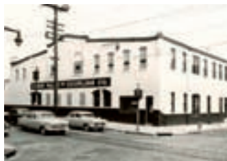
Warehouse and shipping building at 2nd and Columbia in Philadelphia

Due to his ongoing interest and innovative approach to coupling design, he started the Dixon Valve and Coupling Company which produced products for the mining, oil and construction industries.