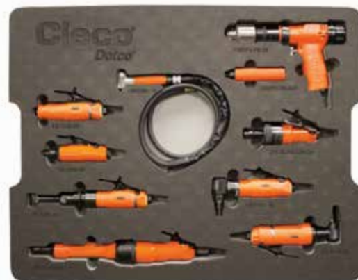
Example: Top layer of the Comprehensive Material Removal Demo Case

Our Material Removal experts will work with you to set up your individual Cleco Dotco Demo Case.