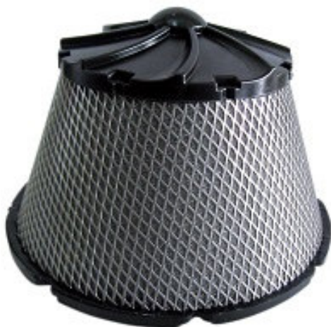
Main filter (washable)