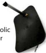
Extended distance sensor