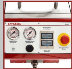
Clear-cut control panel