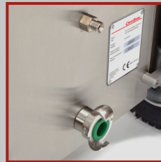
Safe supply connections