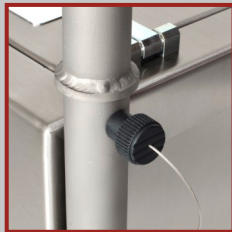
Removable control handle