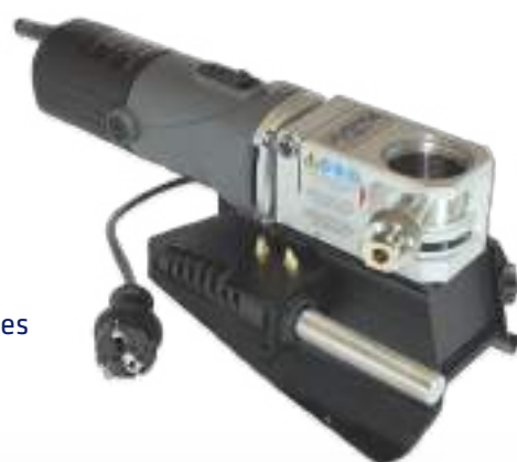
Neutrix with pedestal SW

A stand can be mounted for workshop use.