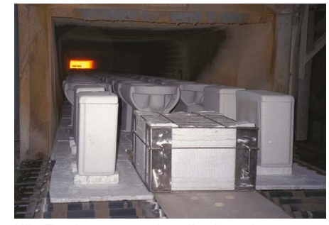
Kiln Tracker system in roller hearth sanitaryware kiln