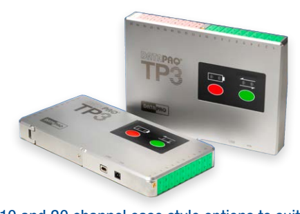
10 and 20 channel case style options to suit barrier design