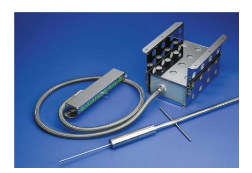
Thermal barrier with 'in kiln' antenna