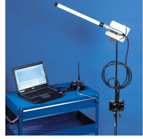
TM21 Radio telemetry system