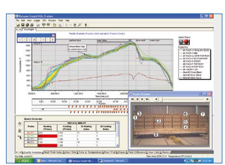
Kiln Tracker analysis software