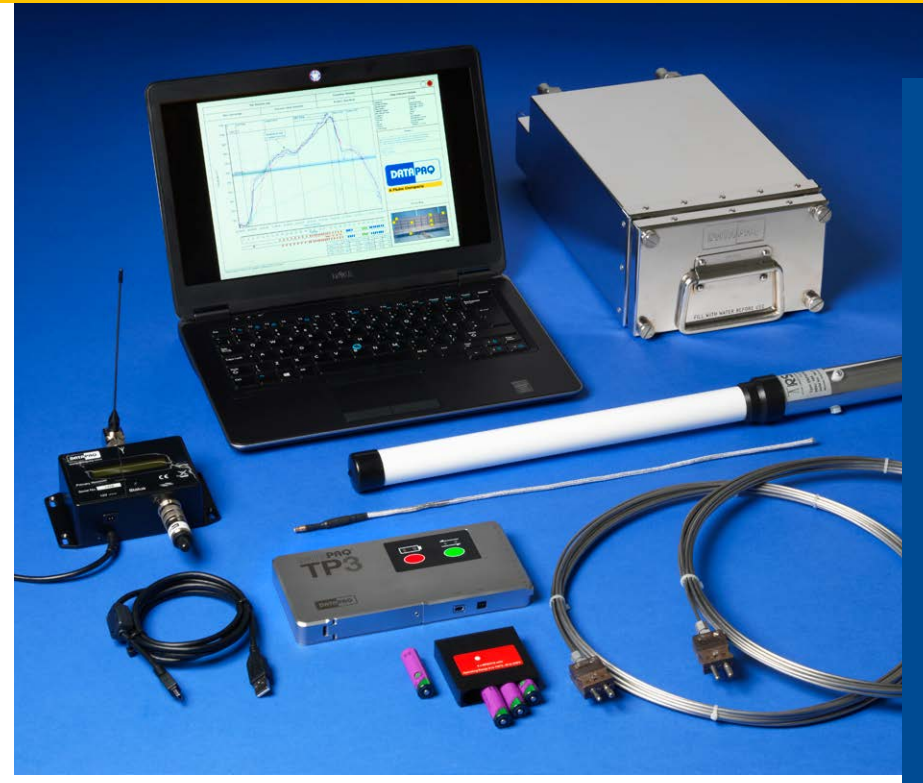
Kiln Tracker system with TM21 radio telemetry system