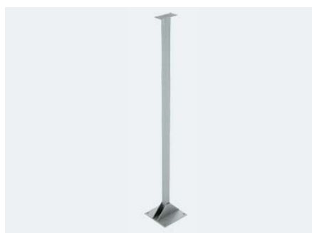
> Stainless steel column for indicator