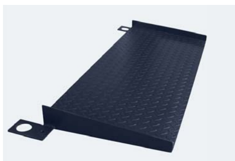
> Iron ramp