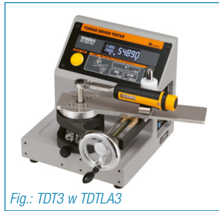
Fig.: TDT3 w TDTLA3