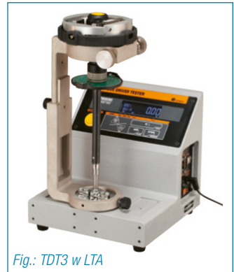
Fig.: TDT3 w LTA