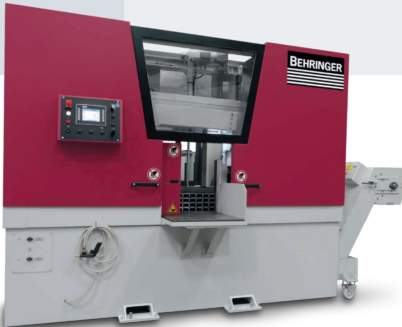
BEHRINGER HBE411A Dynamic