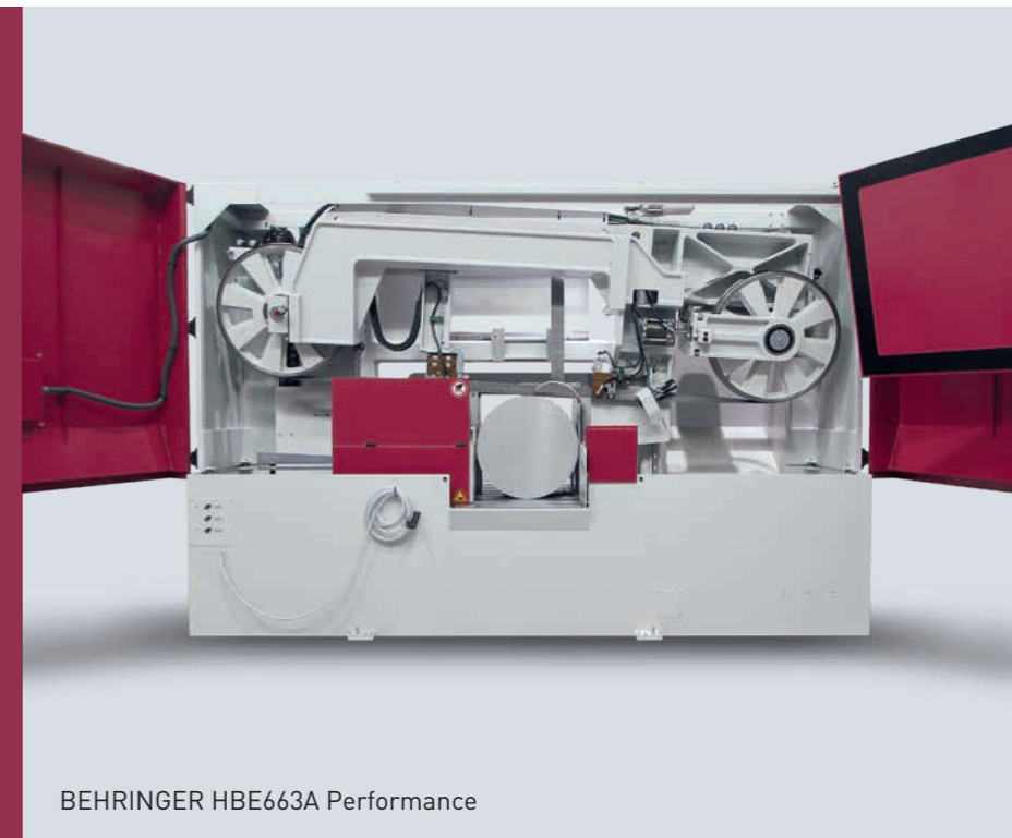
BEHRINGER HBE663A Performance